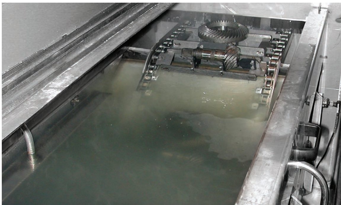
In the quiet ultrasonic bath, both external and internal surfaces are scrubbed by the cavitation of the ultrasonic bubbles.