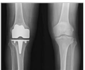
Manufacturers of medical instruments and implants such as this knee joint replacement —

In ultrasonic cleaning, as the frequency decreases, the cavitation bubbles get larger (and the number of bubbles decreases). Larger (more energetic) bubbles are more effective on larger particles.