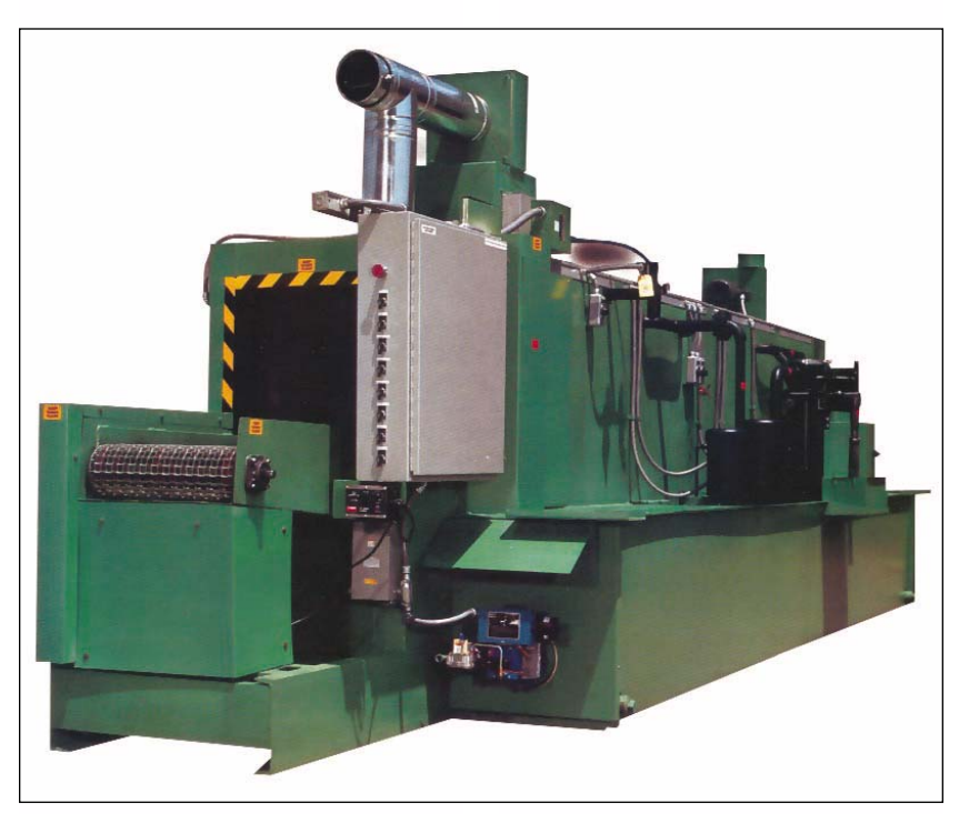
Given the continuous nature of most stamping processes, LS Industries' flow-through parts washer is a typical approach for parts cleaning in metalforming operations.

Thus, solvent cleaning is in an ambiguous position. California tends to have very stringent pollution laws, so similar nationwide crackdowns on solvents may still be a way off. And before a total ban occurs, the death knell for solvents may be sounded by increasing costs of solvent handling and disposal. But these factors must first win out against the sheer effectiveness of solvents. "Given there were no restrictions or limitations," says Kiebler, "everybody would prefer to use solvents because they do a wonderful job."